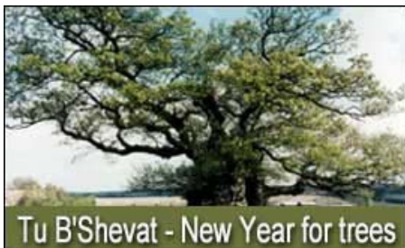
Tu B'Shevat - New Year for trees