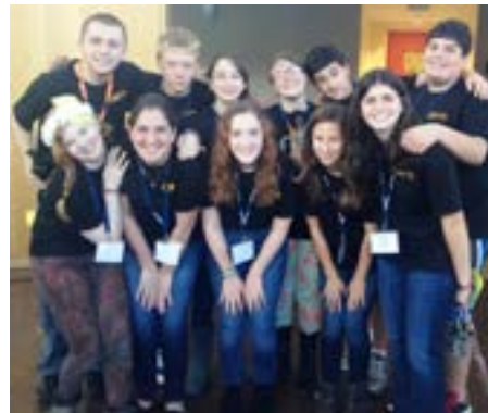
CRC teens at youth conclave